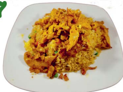
CƠM CHIÊN THỊT GÀ NƯỚNG fried rice w/ grilled chicken $12.00