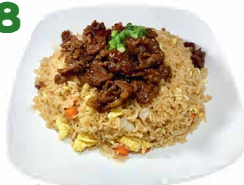
CƠM CHIÊN THỊT HEO NƯỚNG fried rice w/ BBQ pork $12.00