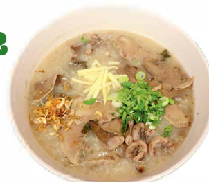
CHÁO LÒNG HEO Congee with pork organ & pork blood Not Available