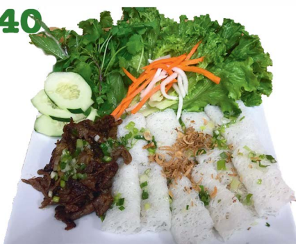
BÁNH HỦI THỊT NƯỚNG Angel hair noodle with BBQ pork $14.00