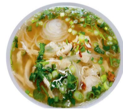
HỦ TIẾU GÀ (NƯỚC/KHÔ) Chicken broth, rice noodle with shredded chicken breast $12.00