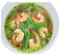
HỦ TIẾU TÔM (NƯỚC/KHÔ) Chicken broth, rice noodle with shrimp $13.00