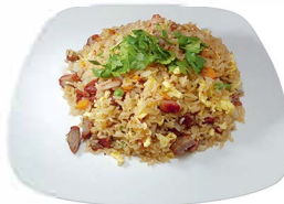
CƠM CHIÊN XÁ XÍU Roasted pork fried rice $12.00