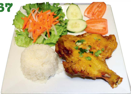
CƠM ĐŨI GÀ NƯỚNG Grilled chicken thigh w/ steam rice $12.00