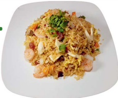
CƠM CHIÊN DƯƠNG CHÂU Deluxe fried rice with Vietnamese sausage, shrimp, chicken & roasted pork $12.00