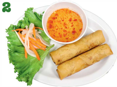
2 CHẢ GIÒ THỊT GÀ (2PCS) Fried Chicken Eggrolls $5.00