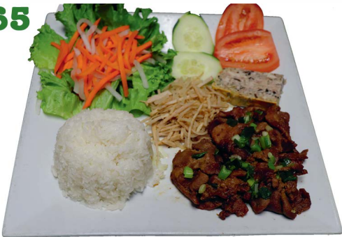
CƠM TẤM THỊT NƯỚNG, BÌ VÀ CHẢ BBQ pork, shredded pork skin and egg quiche w/ broken rice $12.00