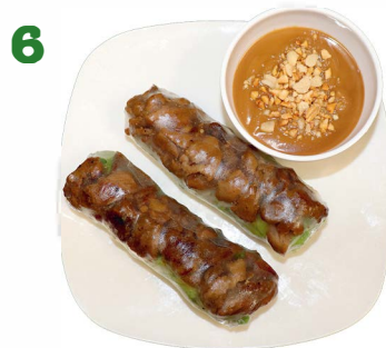
6 GỎI CUỐN THỊT HEO NƯỚNG (2PCS) BBQ Pork Spring Rolls Rice paper wrapped around BBQ pork, noodle, lettuce, basil & beansprouts $5.00