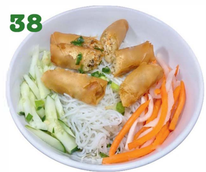
BÚN CHẢ GIÒ vermicelli w/ pork eggroll OR chicken eggroll $11.00