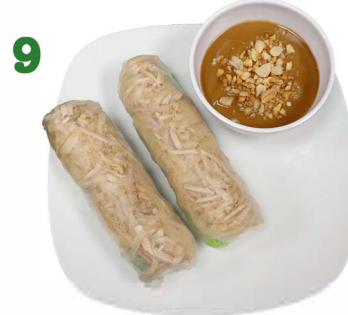
9 GỎI BÌ CUỐN (2PCS) Pork skin Spring Rolls Rice paper wrapped around shredded pork skin, noodle, lettuce, basil & beansprouts $5.00