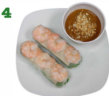
4 GỎI CUỐN TÔM THỊT (2PCS) Shrimp & Pork Spring Rolls Rice paper wrapped around shrimp, pork, noodle, lettuce, basil & beansprouts $5.00