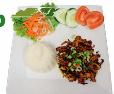
CƠM THỊT GÀ XÀO SẢ ỚT steam rice w/ lemongrass chicken $13.00