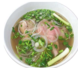
PHỞ NHƯ Ý (CREATE YOUR OWN PHO) Pick 2 options: sliced rare beef, well done flank, tendon, meatball, or tripe. $12.50