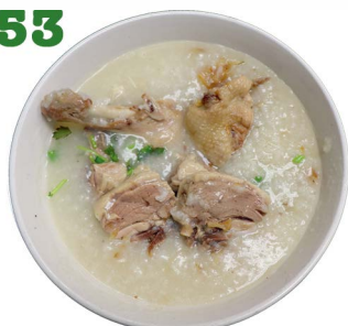
CHÁO VỊT Duck congee $13.00