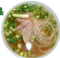
PHỞ TÁI Beef broth, rice noodle soup with sliced rare beef $12.00