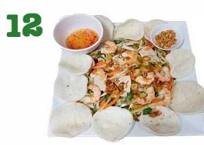
12 GỎI NGÓ SEN Vietnamese lotus roots salad with shrimp & pork $13.00