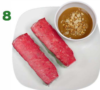
8 GỎI CUỐN NEM NƯỚNG (2PCS) Ground pork Spring Rolls Rice paper wrapped around grilled ground pork, noodle, lettuce, basil & beansprouts $5.00