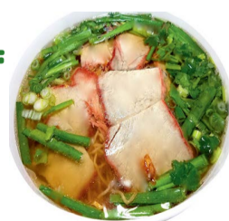
MÌ XÁ XÍU Egg noodle soup with roasted pork $12.00

CAN BE SERVE DRY WITH THINH AN SAUCE OR SOUP