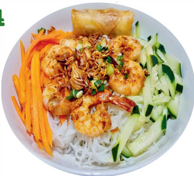
BÚN TÔM NƯỚNG CHẢ GIÒ Vermicelli w/ grilled shrimp & chicken eggroll $13.00