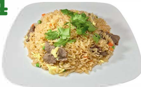
CƠM CHIÊN THỊT BÒ Beef fried rice $12.00