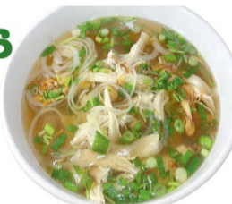
PHỞ GÀ Beef broth, rice noodle soup with shredded chicken breast $12.00