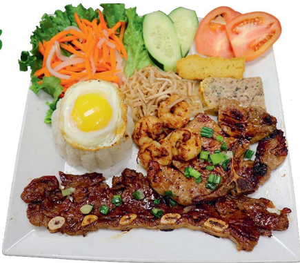
CƠM TẤM THỊNH AN (SUỒN, BÌ, CHẢ, TÔM NƯỚNG, SUỒN BÒ NƯỚNG, TRỨNG) Thinh An special Rice Plate w/ pork chop, shredded pork skin, egg quiche, grilled shrimps, fried egg, and beef short ribs w/ broken rice $14.95