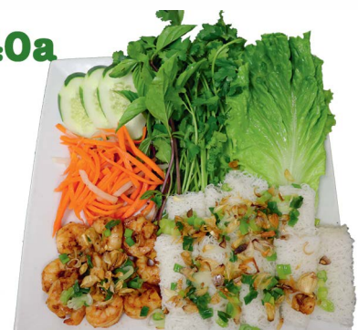
BÁNH HỦI TÔM NƯỚNG Angel hair noodle with grilled shrimp $14.00