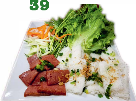
BÁNH HỦI NEM NƯỚNG Angel hair noodle with grilled ground pork $14.00