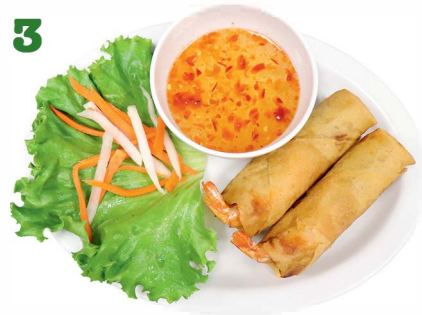
3 CHẢ GIÒ TÔM THỊT (2PCS) Fried Pork & Shrimp Eggrolls $5.00