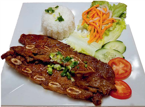
CƠM SUỒN BÒ NƯỚNG Grilled beef short ribs w/ steam rice $14.50