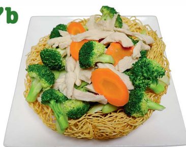
MÌ XÀO GIÒN THỊT GÀ Chicken pan fried egg noodle (crispy) $13.50