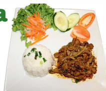
CƠM THỊT BÒ XÀO SẢ ỚT steam rice w/ lemongrass beef $13.00