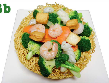
MÌ XÀO GIÒN HẢI SẢN Seafood (shrimp, squid, fishcubes) pan fried egg noodle (crispy) $13.50