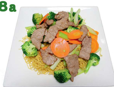
MÌ XÀO MỀM THỊT BÒ Beef stir fried soft egg noodle $13.50