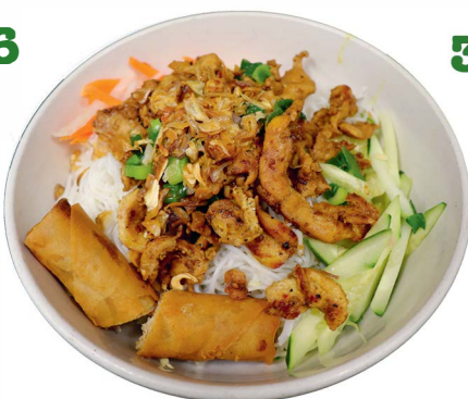
BÚN THỊT GÀ NƯỚNG CHẢ GIÒ Vermicelli w/ grilled chicken & chicken eggroll $12.00