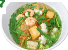
PHỞ HẢI SẢN Beef broth, rice noodle soup with shrimp, squid, fried fish cube $13.50