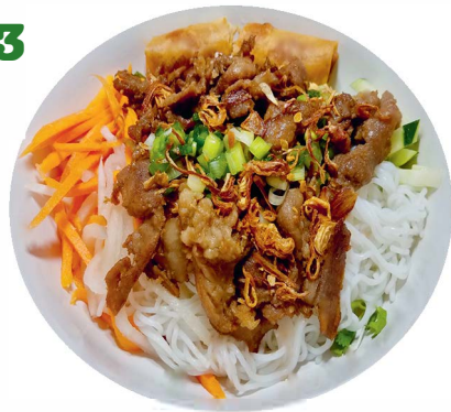
BÚN THỊT NƯỚNG CHẢ GIÒ Vermicelli w/ BBQ pork & pork eggroll $12.00