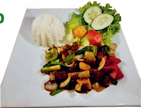
CƠM BÒ LÚC LẮC Shaking beef & onion with rice $14.95