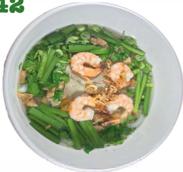
BÁNH CANH TÔM THỊT Udon noodle soup with shrimp & pork $13.50