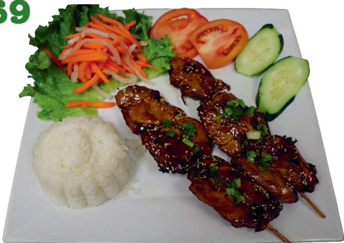
CƠM THỊT GÀ NƯỚNG KIỂU NHẬT Teriyaki chicken with steam rice $13.00