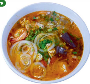
BÚN RIÊU CUA Crab paste rice noodle, shrimp, squid, & tofu $13.00