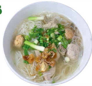
BÚN MỘC Vermicelli noodle soup with pork mushroom meatballs, pork spare ribs, & Vietnamese ham $13.00