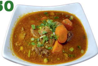
BÁNH MÌ BÒ KHO Beef stew & carrot with bread $13.00