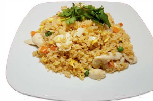
CƠM CHIÊN THỊT GÀ Chicken fried rice $12.00