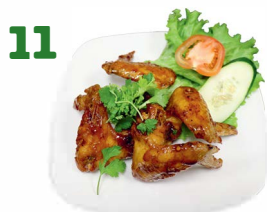
11 CÁNH GÀ CHIÊN NƯỚC MẮM (4PCS) Fried chicken wings with special fish sauce $8.00