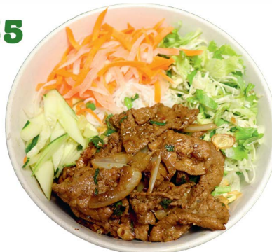
BÚN THỊT BÒ XÀO SẢ Vermicelli w/ stir fried lemongrass beef $13.00