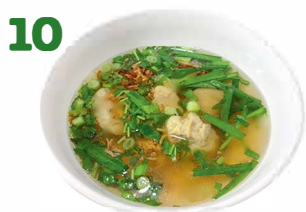
10 SÚP HOÀNH THÁNH (4PCS) Wonton Soup $6.00