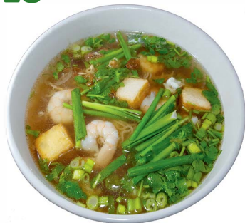
BÁNH CANH HẢI SẢN Udon noodle soup with shrimp, squid, fried fish cube $13.50