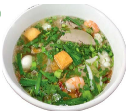
HỦ TIẾU ĐẶC BIỆT THỊNH AN (NƯỚC/KHÔ) Chicken broth, rice noodle with Vietnamese ham, pork, shrimp, squid, fried fish cube, and quail eggs. $13.50