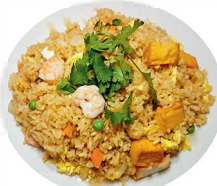
CƠM CHIÊN HẢI SẢN Seafood fried rice (shrimp, squid, & fish cube) $12.00