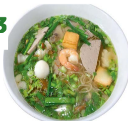
MÌ THẬP CẨM (NƯỚC/KHÔ) Chicken broth, egg noodle with Vietnamese ham, pork, shrimp, squid, fried fish cube, and quail eggs. $13.50