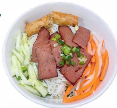
BÚN NEM NƯỚNG CHẢ GIÒ Vermicelli w/ grilled grounded pork & pork eggroll $12.00