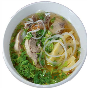
BÚN MĂNG VỊT Vietnamese duck & bamboo shoots vermicelli noodle soup $13.00