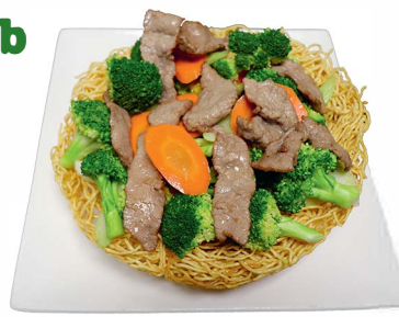
MÌ XÀO GIÒN THỊT BÒ Beef pan fried egg noodle (crispy) $13.50