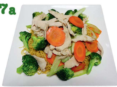
MÌ XÀO MỀM THỊT GÀ Chicken stir fried soft egg noodle $13.50