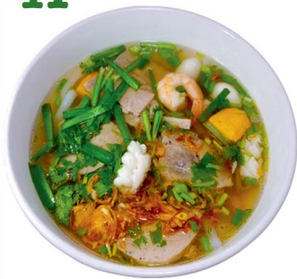
BÁNH CANH ĐẶC BIỆT Udon noodle soup with Vietnamese ham, pork, shrimp, squid, fried fish cube and quail eggs. $13.50