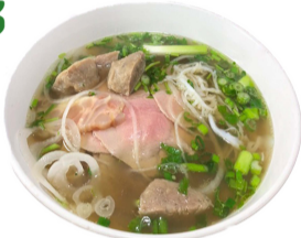
PHỞ ĐẶC BIỆT. Beef broth, rice noodle soup with sliced rare beef, well done flank, tendon, meatball, and tripe $13.50