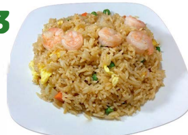
CƠM CHIÊN TÔM Shrimp fried rice $12.00