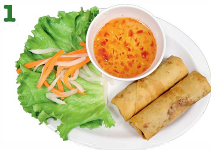
1 CHẢ GIÒ THỊT HEO (2PCS) Fried Pork Eggrolls $5.00