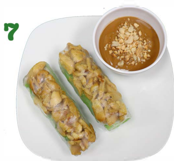
7 GỎI CUỐN THỊT GÀ NƯỚNG (2PCS) Grilled Chicken Spring Rolls Rice paper wrapped around grilled chicken, noodle, lettuce, basil & beansprouts $5.00