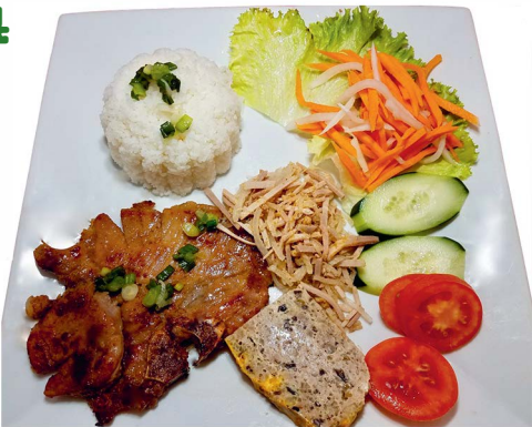
CƠM TẤM SUỒN, BÌ VÀ CHẢ Grilled pork chop, shredded pork skin, and egg quiche w/ broken rice $12.00