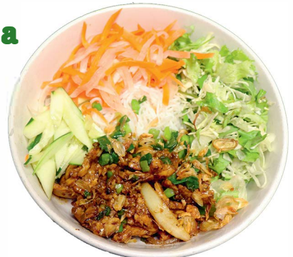
BÚN THỊT GÀ XÀO SẢ Vermicelli w/ stir fried lemongrass chicken $13.00