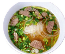
PHỞ BÒ VIÊN Beef broth, rice noodle soup with meatball $12.00