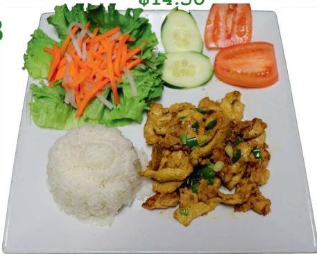
CƠM THỊT GÀ NƯỚNG Grilled chicken w/ steam rice $12.00