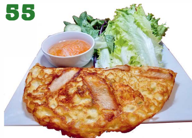
BÁNH XÈO Vietnamese shrimp & pork belly crispy pancake $11.00