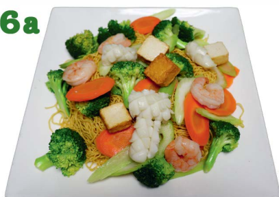
MÌ XÀO MỀM HẢI SẢN Seafood (shrimp, squid, fish cubes) stir fried soft egg noodle $13.50