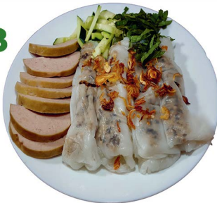
BÁNH CUỐN NHÂN THỊT VÀ CHẢ Vietnamese steam ground pork roll with Vietnamese ham $13.00