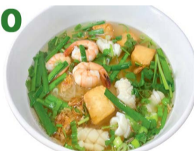
HỦ TIẾU HẢI SẢN (NƯỚC/KHÔ) Chicken broth, rice noodle with shrimp, squid, fried fish cube $13.50