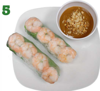
5 GỎI CUỐN TÔM (2PCS) Shrimp Spring Rolls Rice paper wrapped around shrimp, noodle, lettuce, basil & beansprouts $5.00