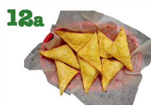
12a Krab Meat Rangoon (8pcs) $7.00