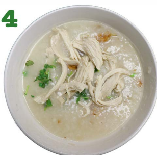
CHÁO GÀ Chicken congee $11.00